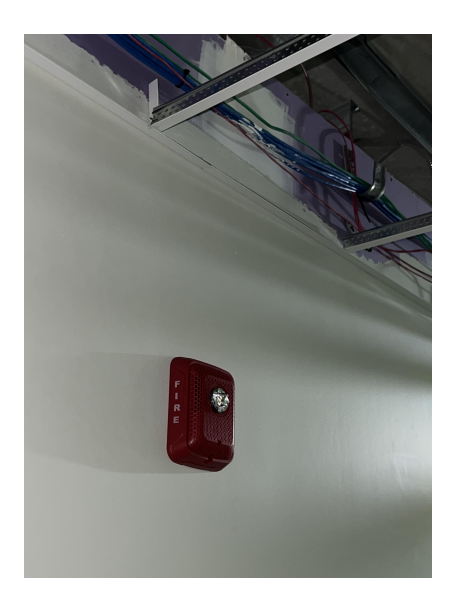
Installing fire alarms throughout level 2.