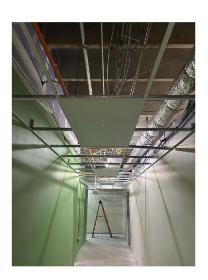
Installing lights in the corridors on level 2