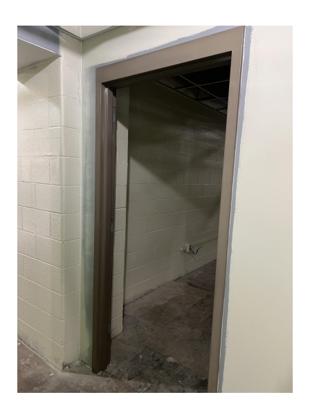
Painting the door frames on level 2.